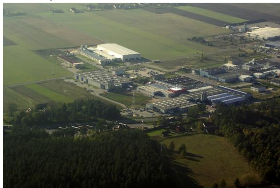
Manufacturing plant located in Suwałki