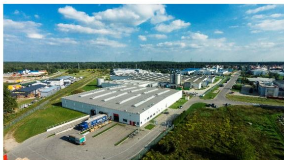
Manufacturing plant located in Elk 2

Porta KMI Poland S.A. operates in Bolszewo, Elk, Suwałki and Arad (Romania), producing over 85,000 exterior, entrance, interior and technical doors per month. As part of its newly adopted business strategy, the company operates in accordance with the principles of open business, cooperation and development.