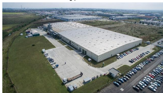
Manufacturing plant located in Romania