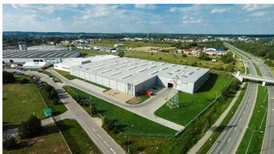
Manufacturing plant located in Elk 1