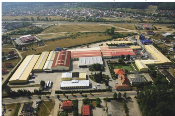
Manufacturing plant located in Bolszewo

Porta KMI Poland S.A. is a Polish manufacturer of doors for external and internal use. The company was founded in 1992 and currently employs approximately 1,800 people.